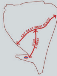
Making the right connections