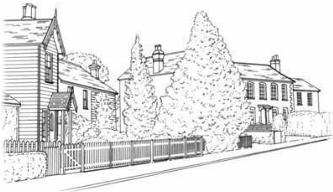
Properties along Dury Road

Dury Road branches off from Hadley Green/Hadley Highstone in a south-easterly direction and contains many high quality and listed properties. These include: no.1 - early 18th century plum brick; nos. 3-11, 15 and 17 all timber framed; nos 5-9, Victorian Gothic front, bargeboarded gables and pretty timber Gothic veranda; nos. 1-17 are notable for their value as a group as are the small row of Victorian terraces on the opposite side (nos 4-18) although the former group are of a superior quality. There are glimpsed views up the slip road containing nos 21 and 23, which are small, attractive cottages. No. 29, Thorndon House, is early Georgian. Nos 27 and 31 are of a similar date. From the top of Dury Road there are views as far down as nos 27 to 31. After this there are long views all the way down to the Wilbrahams Almshouses on Hadley Green Road to which the eye is naturally drawn. 39 Dury Road, Stoberry Lodge, c1830 is a stucco villa, nos 41- 43, Hadley Bourne, St Martha's Convent (listed), is of red brick, mid-to-late 18th century and provides a focal point and an impressive view coming up Hadley Green Road or Green Slip Road.