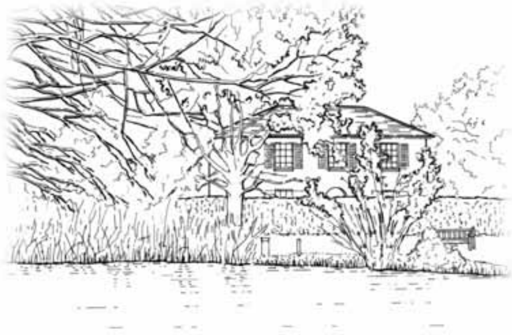
One of the ponds on Hadley Green

open, with thinly scattered trees in small groups, often on low mounds. An ancient hedgerow runs down the western boundary. The Green is dissected by ditches, which provide an important habitat. The five old ponds represent former watering points for horses and cattle, and each has developed its own different character. For the naturalist, however, the greatest interest lies in the site's particularly fine example of acid grassland. The Green supports a good variety of birds and butterflies.