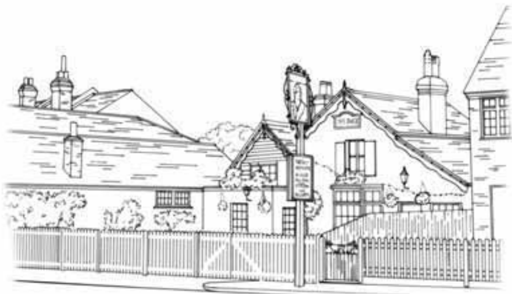
King William IV Public House, Hadley Highstone

Hadley Highstone (part of the Great North Road). The Highstone obelisk is at the junction of Kitts End Road and Barnet Road. The stone, which as noted earlier, commemorates the Battle of Barnet and was moved here in 1840 from its original position some 200 yards further south. The road is lined by cottages of varying styles although it is notable that on the east side the properties might be considered larger, later and more imposing. There is a greater variation of roof heights with some properties up to three storeys high. Most of the properties are noted for their group value as are several other groups along this side of the road (see main map). The houses fall into natural groups of four to six in terms of their style and as sets of small groups are a variety of traditional styles and materials. They also tend to be set back from the road, accentuating their location. A little further down the road on the same side is the 17th century King William IV pub, an attractive timber framed listed building, sited between two other locally listed buildings, the group being particularly important to the Conservation Area. On the west side of the road a notable group of properties are the redbrick terraces (nos. 15-27) which have retained many of their original features. No.1 Hadley Highstone is a picturesque, locally listed cottage which has a splendid setting and outlook facing the green.