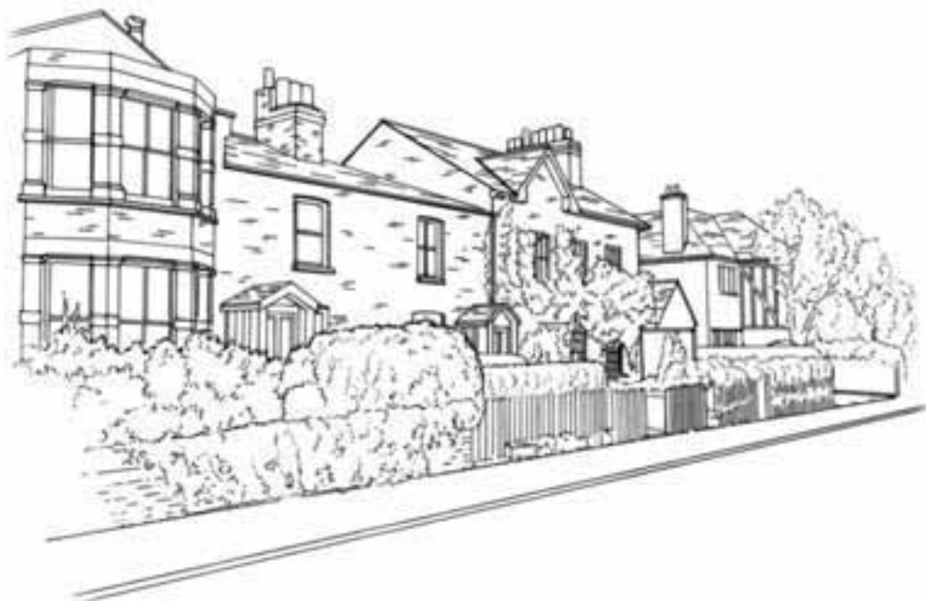
Cottages lining Kitts End Road

Kitts End Road. This is the northern end of the Conservation Area and only a small part of Kitts End Road is included (this is the borough boundary). A notable property, the locally listed Basket's Lot, is set within its own grounds, with highly screened vegetation in the island between Kitts End Road and Barnet Road. There are long views into the Conservation Area from Kitts End Road, almost as far down as the Green. Attractive cottages line the route (although they are considered part of Hadley Highstone).