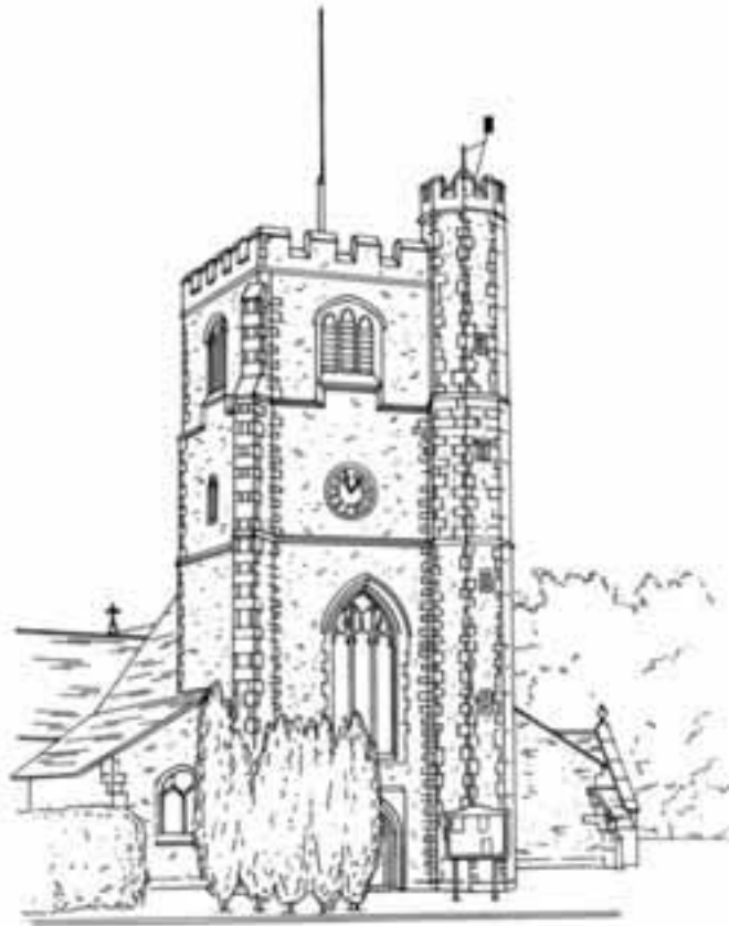
Church of St Mary the Virgin, Monken Hadley