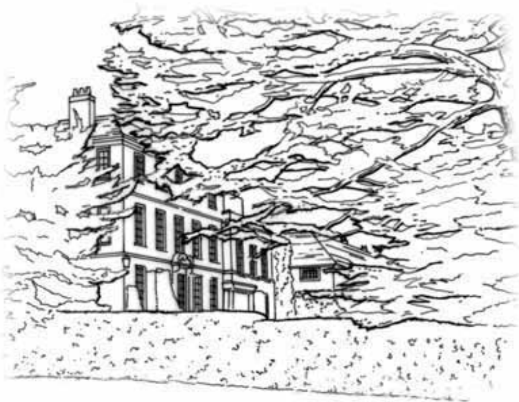
Hadley Hurst, The Common

properties which are of little architectural merit and are quite highly screened by vegetation. Hadley Hurst is a large, three storey, imposing c1700 red brick property that neighbours Hadley Hurst Cottages (18th century) which were originally stables for Hadley Hurst. Also listed, they are again on quite a large scale and centred around a tall archway. The next cluster of listed buildings provides an interesting combination beginning with the white stuccoed Georgian, The Chase, with its central doorway and large broad framed windows; then the more modest Aynho which is a cottage of 2 storeys with a large central chimney and two front gables. Next is the larger Hurst Cottage, again a white stuccoed Georgian building, slightly less grand than The Chase but not dissimilar. The last listed building in sub-area 7 bringing one back towards the village, is Gladsmuir, which is a c1830 red brick villa with a shallow roof and deep eaves. Gladsmuir is Victorian and notably different in character to the other properties