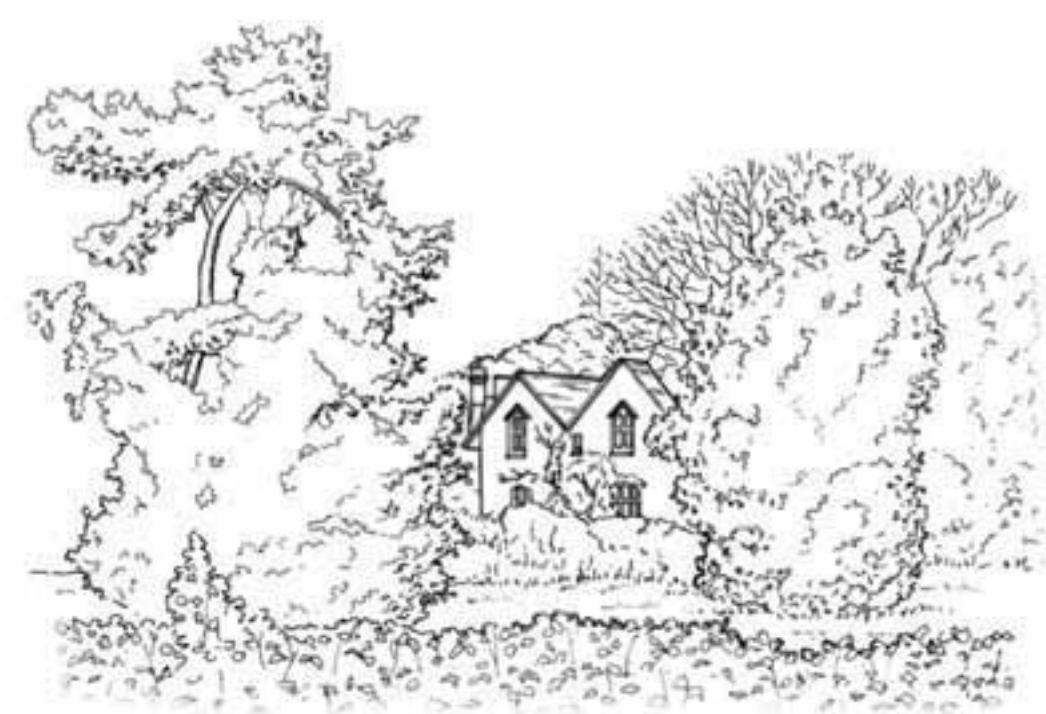
A glimpsed view through the vegetation of Hadley Green of Windmill House

Dury Road contains an impressive range of listed buildings. The properties on Hadley Green are more notable for their variety of scale, texture and positioning in this semi rural location, which is what makes this part of the route so attractive. Viewed from a northerly approach, the first property on Hadley Green, Green View, becomes a focal point. This is an attractive white stucco Georgian house which would seem to mark the beginning of varying styles of development from Hadley Green to Hadley Highstone. The road Hadley Green splices the green while Hadley Green West, (which is included in area 3) provides the western boundary. Dury Road and Hadley Green Road provide the northern and eastern boundaries respectively. The locally listed Windmill House can be accessed from the western side of Hadley Green. Windmill House is a very attractive but restrained Victorian Gothic style. Glimpsed views of this imposing property can be seen from the road through the mature vegetation of the green.