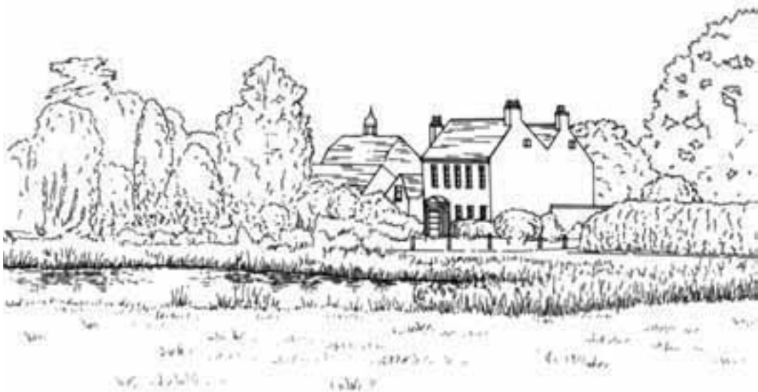
Large Georgian country residences were built around the Green and Common

Monken Hadley is still predominantly rural. Its special character stems from development in the 18th and 19th centuries. Large Georgian houses with impressive gardens were built as country residences for the London gentry of the day. These surround the Green and edges of the Common. The scattered groups of mature trees are vestiges of the rural outlook these properties once enjoyed.