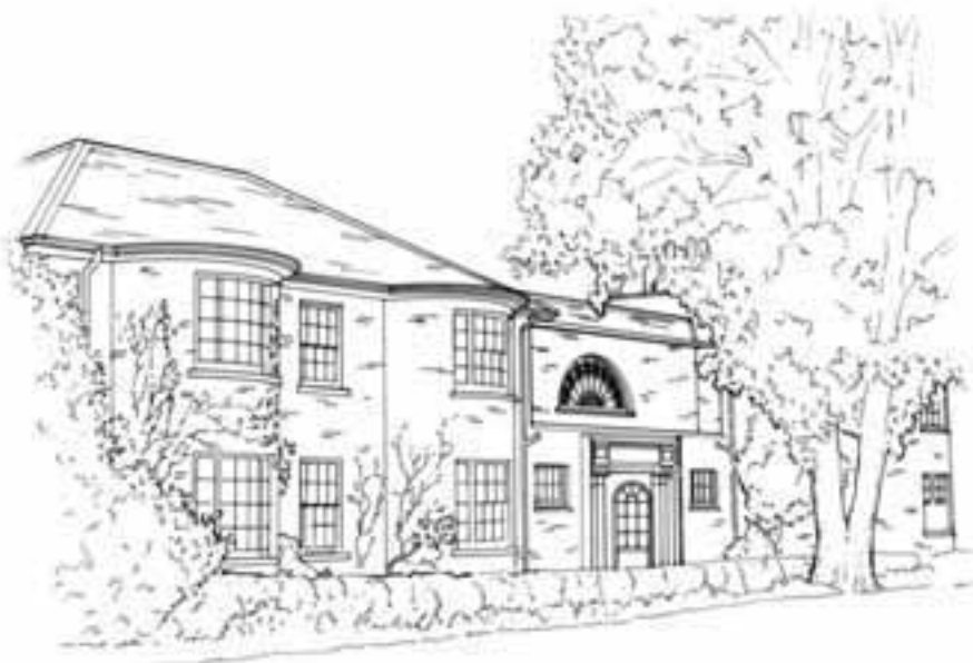
Old Fold Manor, Old Fold Lane

Taylor's Lane leads off Hadley Highstone (on the west side), around to Old Fold Lane and contains pretty, modest cottages notable as a group and built in close proximity. There is a strong front boundary. Nos. 7 and 8 are locally listed. Old Fold Lane contains a group of attractive Victorian terraced properties on one side only, facing the high boundary vegetation of the golf course although there are glimpsed views beyond. This part of the Conservation Area is characterised by restricted road widths and a tighter urban grain. This opens out at Old Fold Close and further more onto the Green itself. Old Fold Close branches off from the lane and contains handsome locally listed properties. They are quite enclosed by a strong vegetated boundary with glimpsed views of the houses from all angles. There are direct views into the close from the lane. On the opposite side is the listed Old Fold Manor Golf Club House, two houses of c1820. It was adapted in the early 20th century by Charles Weymouth as a clubhouse with an added central link with four columns. Next door, the listed Old Fold Manor House of c1750 is also a fine stuccoed five bay building which can be glimpsed from the lane through its boundary vegetation. There are the remains of a moat to the west. The Manor faces (although set back) onto the Green and there is a path which leads invitingly onto the Green along the front of the Manor.