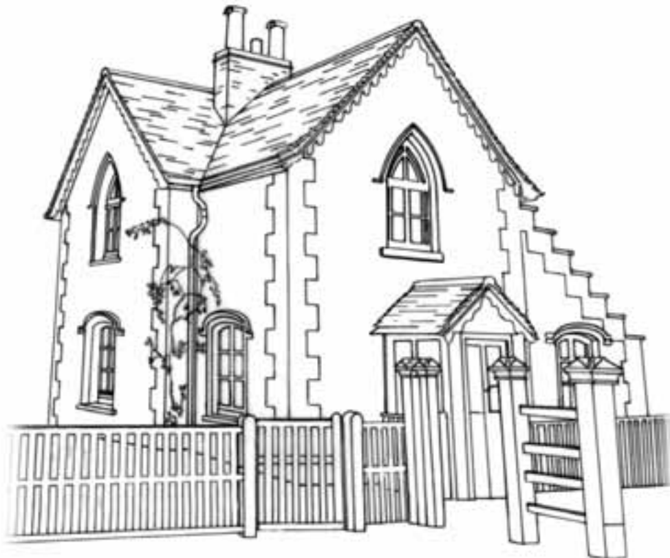
The Gate House, Monken Hadley Village

grounds. These properties are quite enclosed and set back behind vegetation and tall brick walls, although views of the houses are possible through their front gates. Beacon House and Grove Cottage are nestled in between The Grove and the Church and are highly attractive timber framed buildings behind later brick facings. The churches other neighbours are the impressive Pagitt's almshouses of Gothic flint appearance, alongside the Gate House and Rectory buildings. The Gate House is considered as being the beginning of Hadley Common and is an early Victorian house with listed timber barred gates across the road acting as a pinch point and traffic calming measure. The Rectory buildings are also of a Gothic appearance in red brick and are locally listed.