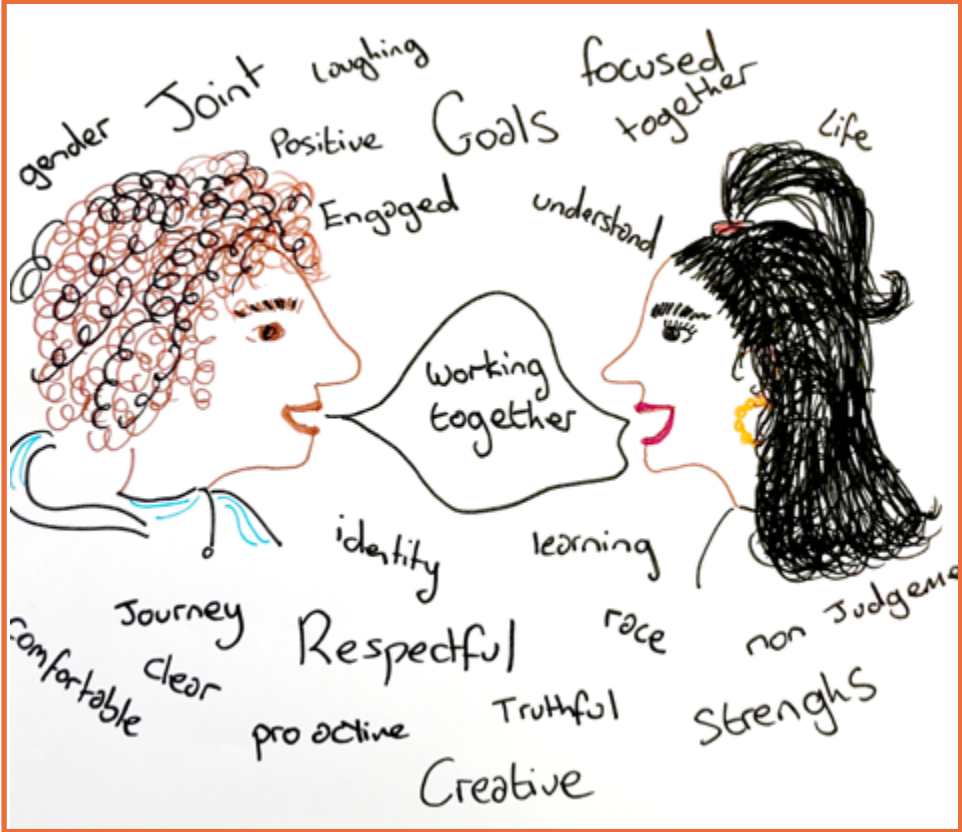
Coproduced by JD and YB as part of their Reparation-10/06/2019