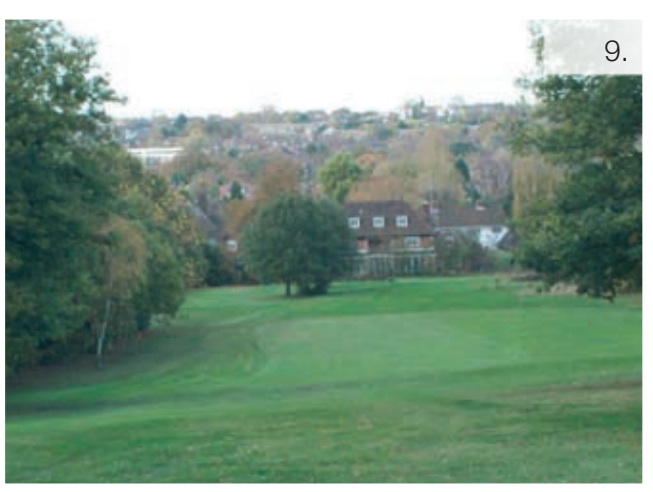
Poplars line the north-east side (Photograph 8) and looking down holes 8, 7 and 6, views are provided of distant suburbs of London (Photograph 9).