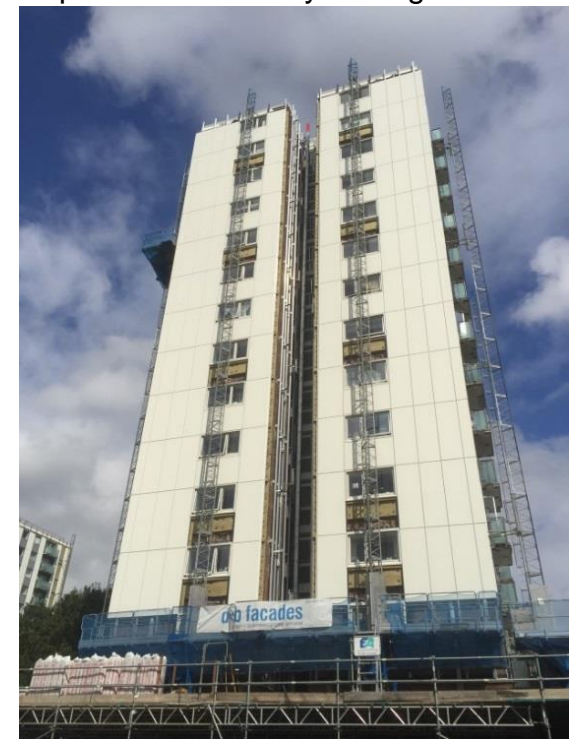
Cladding replacement works underway at Granville Road

Approximately 7,000 homes in Barnet are managed by Housing Associations and these are regulated by the Regulator of