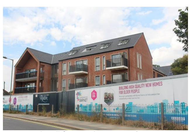
Ansell Court under construction

Barnet Homes has recently completed building a new 53-unit extra care scheme at Ansell Court (formerly Moreton Close NW7). This scheme has been designed with a focus on the needs of people living with dementia to meet the growing need for these services. Sites for two more extra care schemes have been identified and construction on these is expected to start in 2019, providing a further 125 properties.