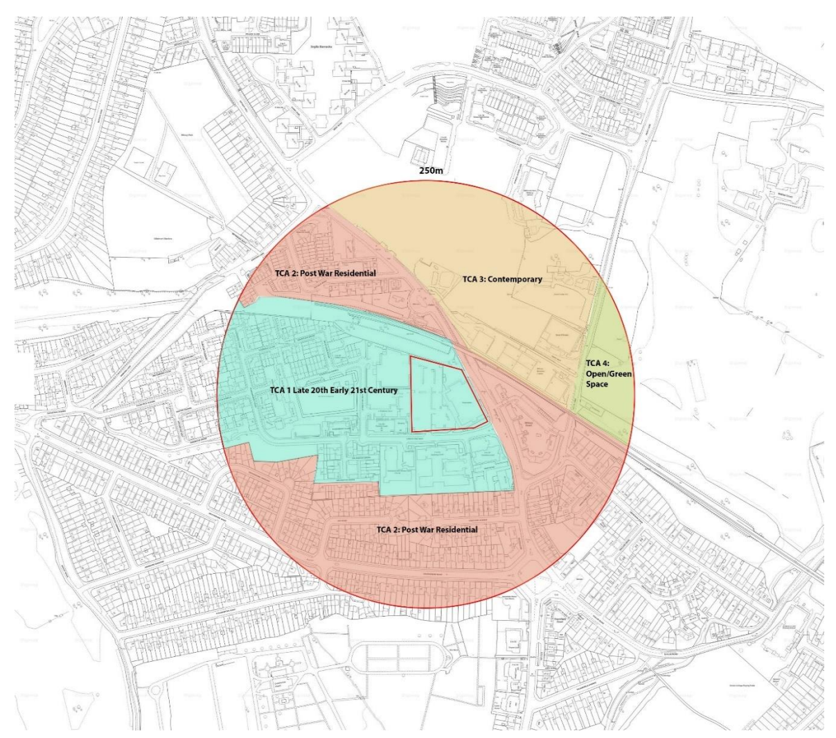
Figure 1 - Map of Townscape Character Areas.

6.1 We have identified four townscape character areas within the study radius of 500m from the centre of the Site. These are shown on figure 1 below; a summary description of each character area is also below. The purpose of providing these here is to show that the surrounding townscape, while characterised by predominantly low-rise buildings, has accommodated new buildings of additional height (to the north) and is in a location of transition, close to Mill Hill East underground station. The existing baseline condition of the townscape are that while a tall building on the Site would be a new addition typologically, it can be accommodated by the existing character of the area.