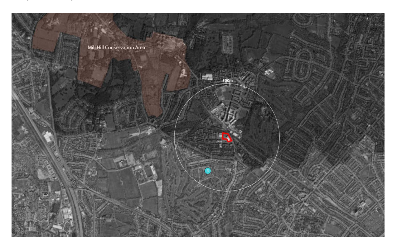
Figure 3 Heritage Asset Plan. The number 1 to the south west denotes the Grade II listed Tomb of Charles Atkin Swan

There is sufficient distance (approx. 500m) from the conservation area boundary to the Site ensuring that any visual incursions would be incidental and are unlikely to impact any contribution setting makes to significance. There is one listed building within 250m of the Site, which is the Grade II listed Tomb of Charles Atkin Swan; again, the distance and intervisibility would mean it is unlikely development on the Site would impact any contribution setting makes to significance.