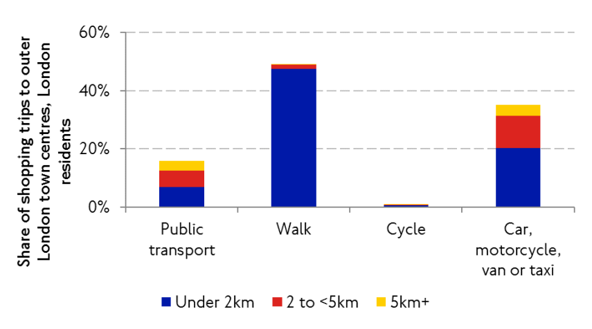
Figure 1 – Outer London town centre shopping access by mode and distance