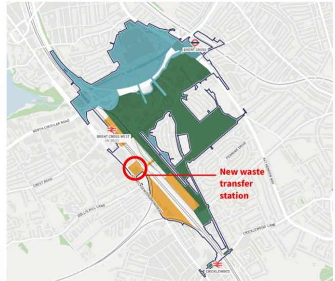
Plan of the site with Brent Cross Thameslink in yellow and green and blue representing wider regeneration scheme

This will enable the construction of a new train station and a new town centre for north west London as part of the Brent Cross Cricklewood regeneration scheme bringing new homes, work and leisure opportunities to the local area.