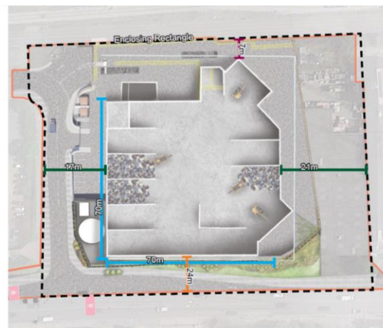
Impression of internal finished arrangement

Although you may experience some noise close-by our site, much will be carried out inside the existing building and we will be carefully monitoring noise levels to make sure they don't exceed levels we've committed to the planning authority in advance. Noise levels will be less during the internal building demolition works listed above but inevitably increase as we move outside.